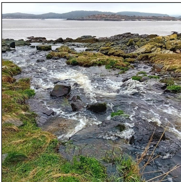
Favourite of the Month Rockcliffe Burn

For more photos taken by the West Wolds u3a Digital Photography Group look at our Challenges page on the website at https://westwoldsu3a.org/?page_id=8458