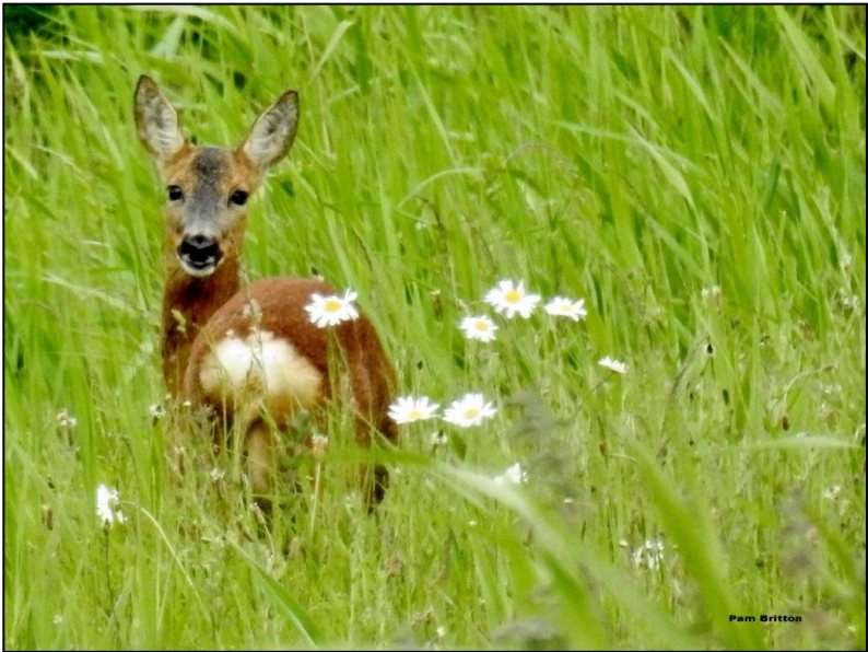
Rule of Thirds