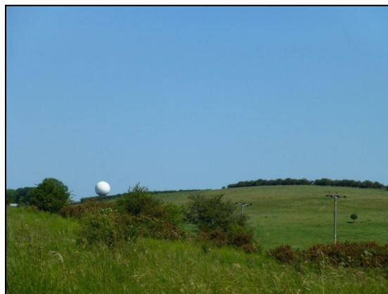
Distant view of Wolds Top on Normanby Hill

At times there were long upward slopes and I am sure that one part was about a 1 in 4 drag up a hill, but it was very enjoyable and the views over the Wolds at the highest point were amazing.