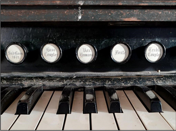
Word & Text Taken by Suzanne Barker

For more photos taken by the West Wolds u3a Digital Photography Group look at our Challenges page on the website at https://westwoldsu3a.org/?page_id=8458