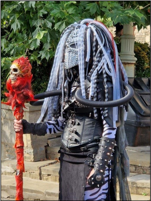
Steampunk Festival

For more photos taken by the West Wolds u3a Digital Photography Group look at our Challenges page on the website at https://westwoldsu3a.org/?page_id=8458