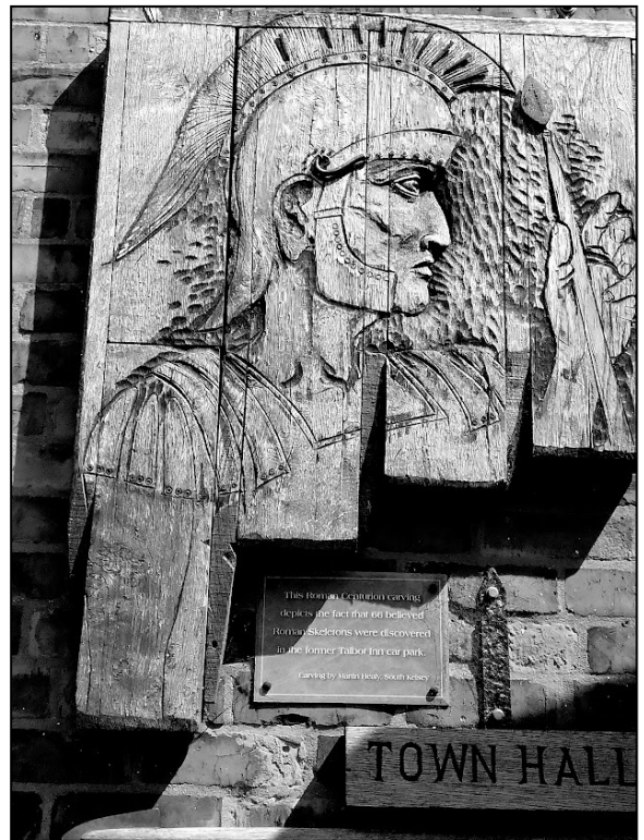
Black & White – Roman Centurion Carving Caistor

For more photos taken by the West Wolds u3a Digital Photography Group look at our Challenges page on the website at https://westwoldsu3a.org/?page_id=8458