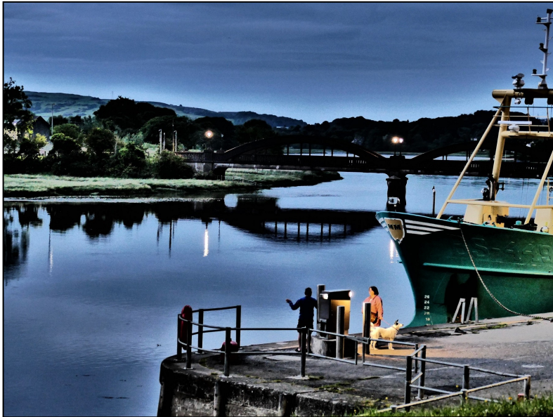
Best Photo of the Month

River Dee, Kirkcudbright, Galloway