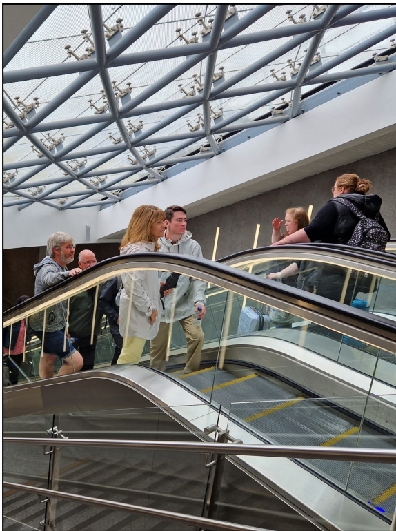
Passengers on Dundee Station Escalator

River Dee, Kirkcudbright, Galloway