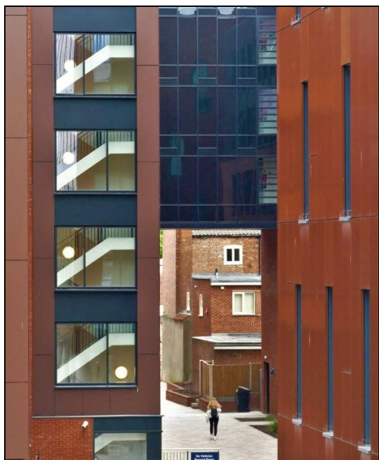
My Favourite Place