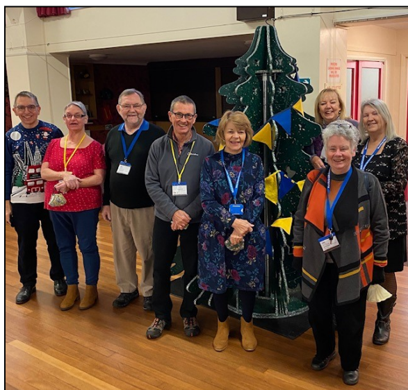
Some of Committee Members & Helpers at Xmas